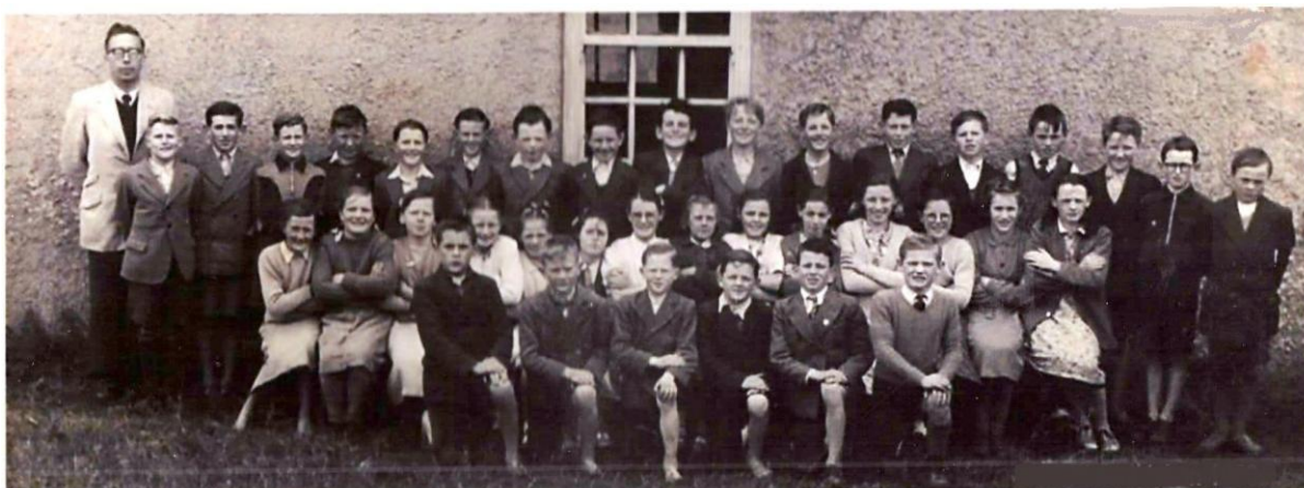
Willbrook School, 1950s