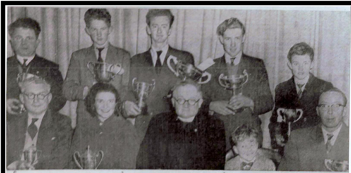
At Scariff Drama Festival, April 1957