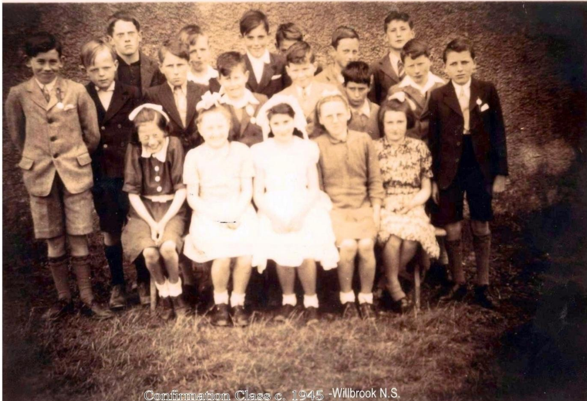
Confirmation Class c. 1945 -Willbrook N.S.

was built at a cost of £249, two thirds of which came from the National Schools Board grant. The building was stipulated to accommodate 75 pupils. The school opened on 7 July, 1884 though the certificate of completion is dated 22 September. It consisted of just one room (28 ft. x 16ft) and a porch until 1928 when a second room was added.