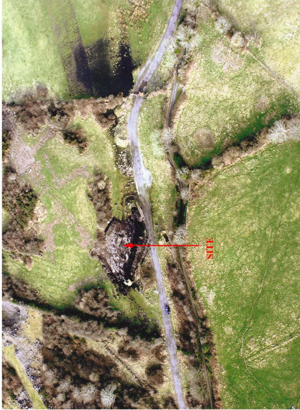
Plate 1. Aerial view of site looking west