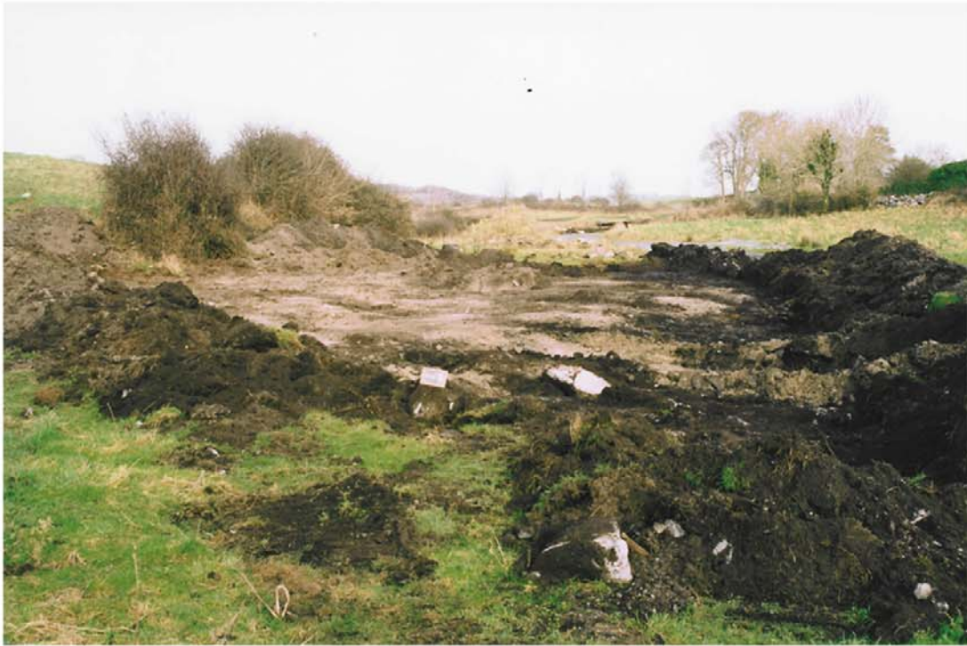
Plate 2. View of site after stripping showing natural boulderclay. Looking east