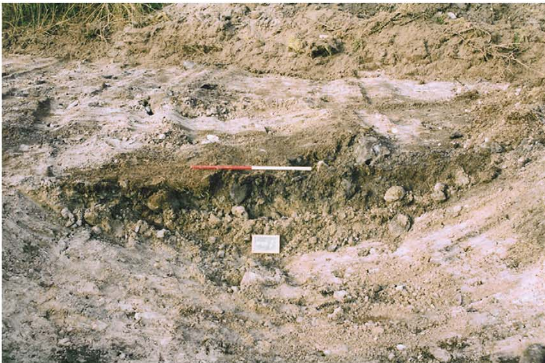
Plate 3. Area of peaty fill within natural boulderclay close to the base of the hillock. Scale 1m. Looking north