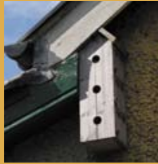
House sparrow nest box on the side of a house.

If birds are present in a building in which you plan to carry out works, then there may be an opportunity to incorporate "accommodation" for them into the design through the use of nest boxes. Most species that use buildings, especially hole or cavity nesting species will readily take to nest boxes. Swift colonies are very susceptible to habitat loss from building renovations, yet it is easy to design such renovations to allow swifts to nest in the buildings by providing appropriate nesting boxes.