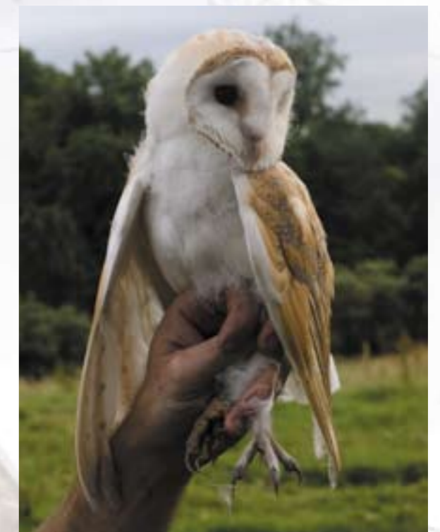
Barn Owl. (John Lusby)

Barn Owls typically use large, old stone buildings where they nest in cavities in the chimney or wall, all year round, and therefore can be adversely affected by renovation works at any time of the year. Any building that offers a suitably large cavity, including modern metal and concrete structures or even single-storey cottages with a roof-space or intact chimney-breast, can be occupied. Whenever a building is being renovated, checking for the presence of Barn Owls (pellets, droppings - also known as whitewash, and feathers) should be undertaken as a matter of course. Barn owls are 'red-listed' in Ireland: this means that, due to steep population declines, they are of 'high conservation concern' according to BirdWatch Ireland. Over 90% of the estimated 300 pairs in existence in Ireland nest in old buildings. There may be several reasons for the population decline, but the loss or renovation of once suitable buildings has been identified as a contributory factor. If you find any signs of Barn Owls, contact BirdWatch Ireland for advice (see contact info on the back page).