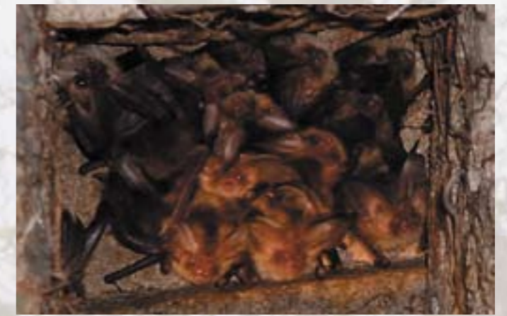
Brown long-eared bats roosting inside a wall. (Conor Kelleher)

Trees, caves, old buildings and cellars were once the traditional roosting sites for bats but since these are less available now, bats are being forced to use any kind of building. All buildings, in particular, the walls, eaves and roofs are potential roosting sites. Bats like clean and draught-free buildings, without dust or cobwebs and normally conceal themselves in crevices, behind roofing felt, in wall cavities or under ridge tiles. They don't bring in nesting materials and will not gnaw wood or electric cables.