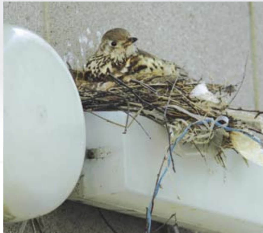
Mistle Thrush nesting on exterior light of a modern building.

Most birds prefer quiet and undisturbed buildings for nesting. Old stone ruins, such as castles, old houses or even churches, can provide them with holes and crevices in which to nest. Buildings that are covered with ivy or other creepers offer even more cover for nesting birds. However, birds will also use buildings that are in everyday use. Many, such as House Martins, build or access their nests on the outside of buildings, but a few, such as Swallows, actually take up residence inside buildings. Some birds, such as Starling or Pied Wagtail, will take advantage of the warmer air in the middle of cities and use buildings to roost during winter. Even small wooden sheds or walls can be occupied by a Wren or a Robin looking for a nest site in a sheltered spot, safe from the weather. Generations of Swallows can use the same building to nest in for several years.