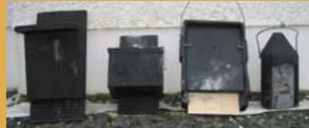
Different styles of bat boxes all painted black to absorb more heat from the sun thereby keeping the bats warm. (Tina Aughney)